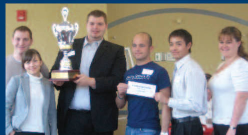
Delta Sigma Pi