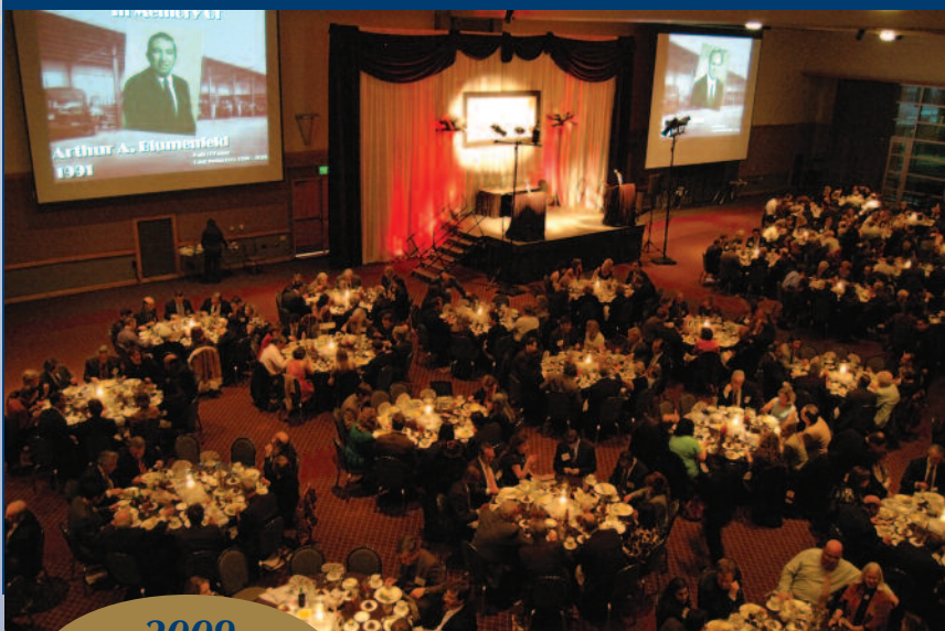
2009 Hall of Fame

Corporate table sponsorships are available at $700 for a table of ten. Individual tickets are $75. To make reservations or to inquire about sponsorship opportunities, contact Tina Armijo in the Development Office at (505) 277-6413 or email armijo@mgt.unm.edu . ■■■